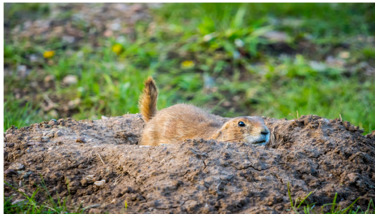
Black-tailed prairie dog

During the pilot study, several previously unknown issues arose. The primary concern was the engine’s throttle, which was not identified until hole number 5 in Site 2. Initially set at approximately ¾ open, it was subsequently adjusted to full throttle for the remaining treatments. The potential impact of this adjustment on treatment efficacy remains uncertain, but it likely had some marginal effect, possibly a few percentage points.