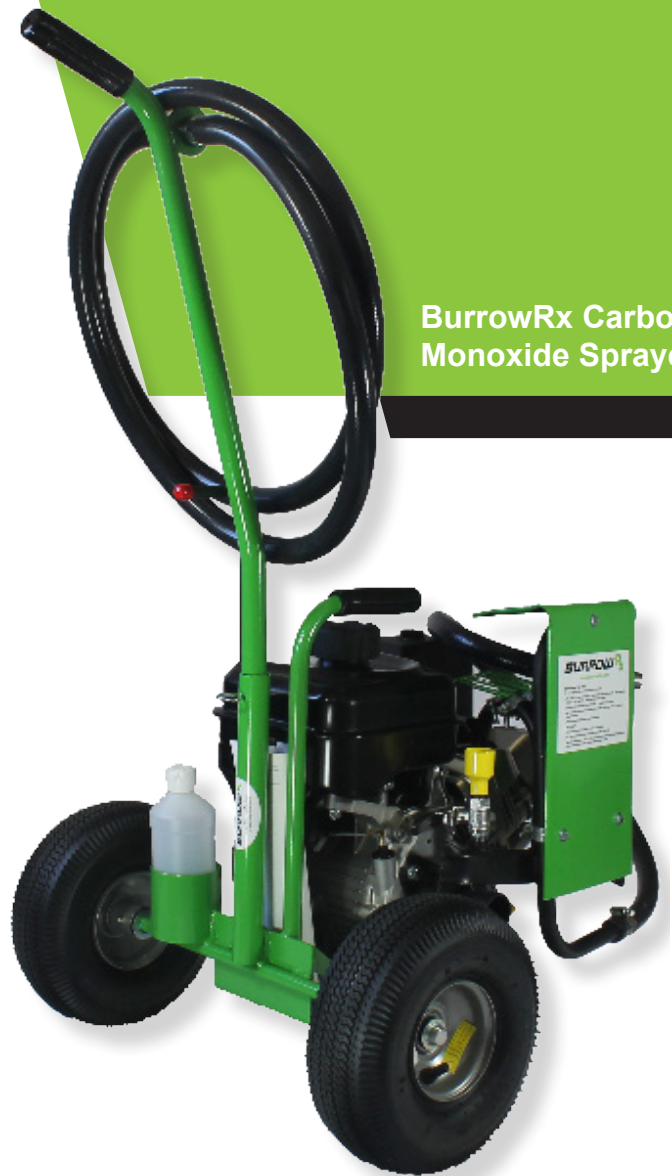
BurrowRx Carbon Monoxide Sprayer

Rarely does a rodent have a chance to escape its burrow before it dies, eliminating the need to dispose of the carcass, which naturally decomposes inside the tunnel system. After the treatment method is finished, the entrance and exit holes should be entirely sealed off to complete the eradication.